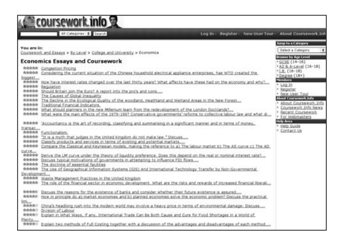
Figure 4. Essays on offer from Coursework.info

A downside of the ease of access provided by the Web is the great ease with which students can plagiarise existing material. Feeding this temptation are a spate of so-called 'research assistance' essay banks. Students donate or sell their essays to a bank, along with feedback they were given by their tutors. Other students can then browse through these to find an essay similar to what they are working on and pay a small fee to download it. Each site may have several hundred essays specifically on economics, although many are of such poor quality that students have little to gain by submitting them. Figure 4 shows some of the economics content offered by Coursework.info, which invites users to 'invest in [their] education' by paying to download the essays. Similar sites are listed by the JISC Plagiarism Advisory Service (http://www.jiscpas.ac.uk/site/res essay.asp).